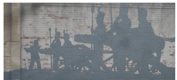
Cedar Grove Cemetery, Portsmouth VA