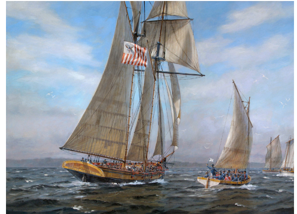
USCG Thomas Jefferson

Visit the Commission's website at http://va1812bicentennial.dls.virginia.gov