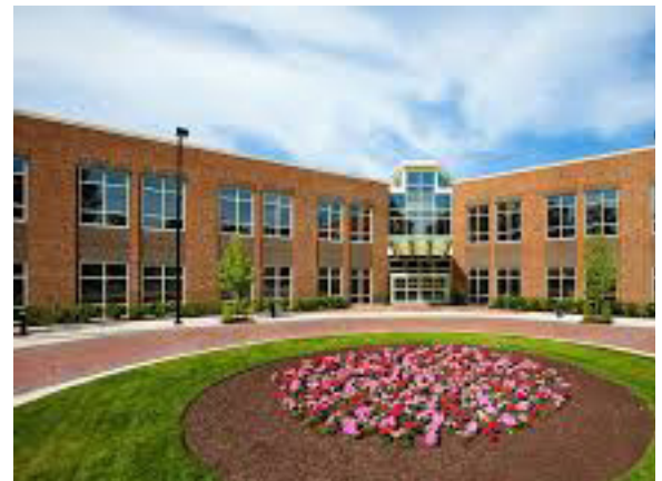
Hampton University, Hampton Virginia.