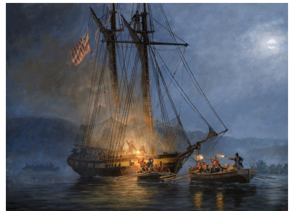
USRC Surveyor