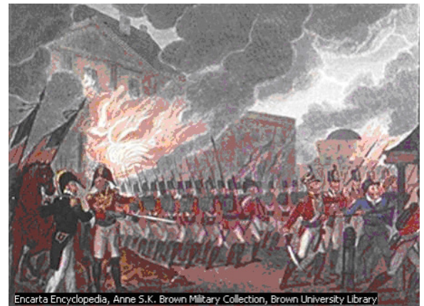
Burning of Washington D.C.