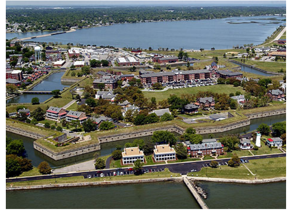
Fort Monroe, Hampton Virginia.