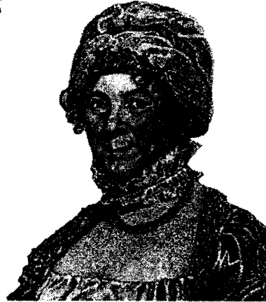
First Lady Dolley Madison